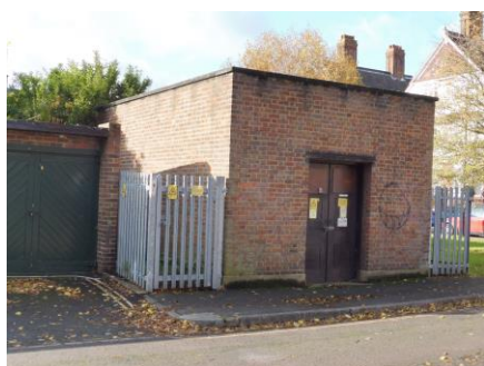
Electricity Sub-station adjacent to garages.