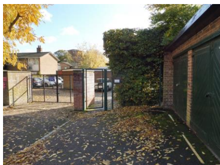
Structure (left) belonging to the land lying to the north-west of Sutton Court Road, the south-west of Fauconberg Road and to the south-east of Grove Park Terrace.

The requirement for adjacent excavation notices is subject to confirmation of the proposed depth and position of excavations and the foundation design of any adjoining properties within 6 metres and confirmation of the depth(s) to which all parts of the new development will extend.