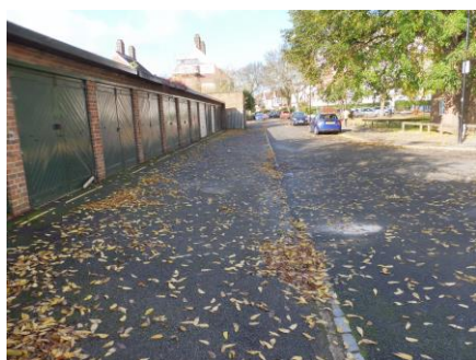
Boundary to Florence Gardens marked with precast concrete paviours.