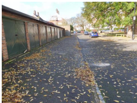
Photo of the front elevation.